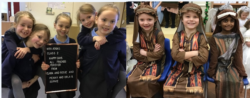
Class 2 worked hard to develop strength and balance in gymnastics and co-ordinated dance moves with a partner to create a garden themed mirrored sequence.