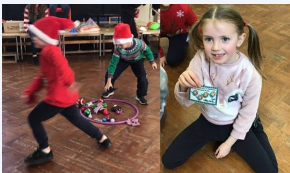
Racing towards the end of December with The Santa Dash on Christmas jumper day.