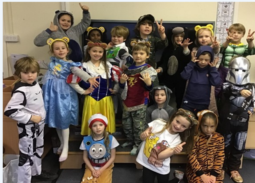
A 'spotacular' day was had by all for Children in Need. Class 2 joined with Class 1 to perform Hey Ewe! It was 'barriliant'!