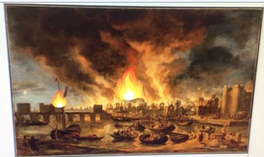
Fire of London scene created using Scratch programming.