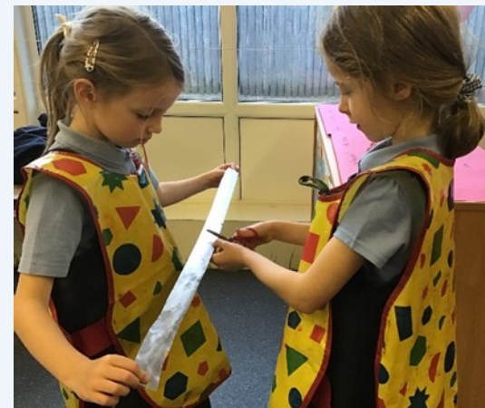
Working as a team to craft a magical wand using step-by-step instructions in writing.